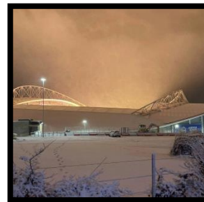
Albion's Stadium looking glorious in a blanket of snow.